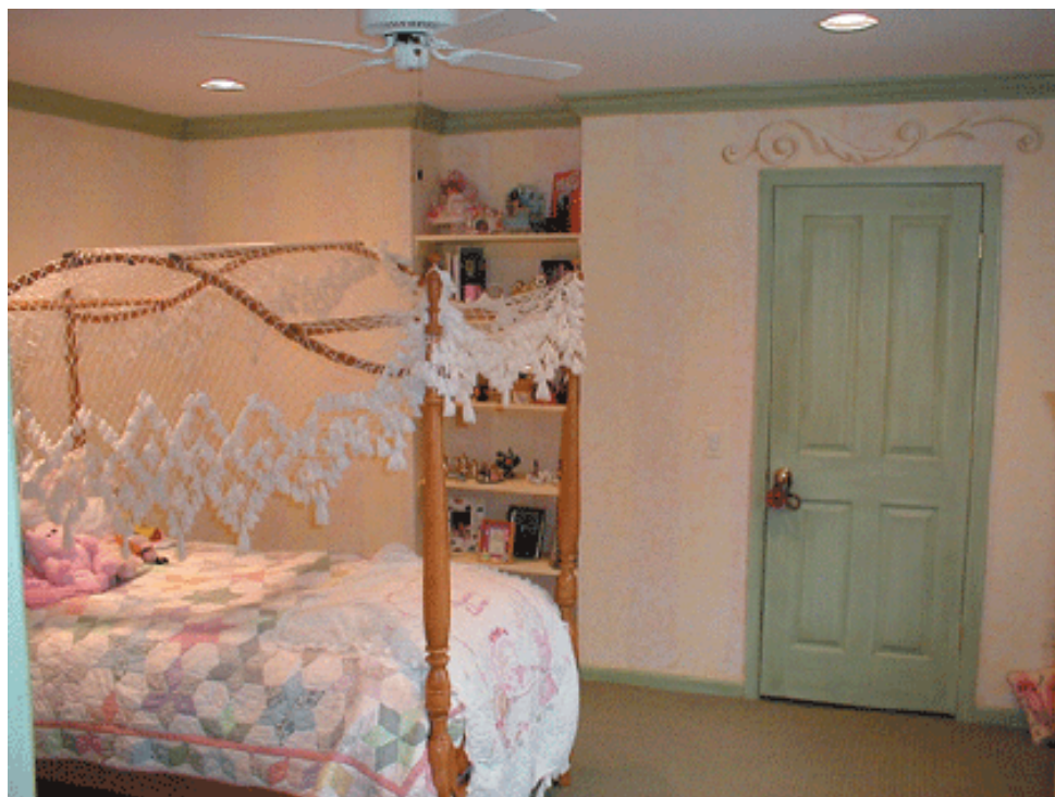
Hand painted decorative scroll over door frames

Second in a series of 3 tutorials, hand painted scrolls add the finishing touches to the wall treatments in this Decorating Children's Rooms series.