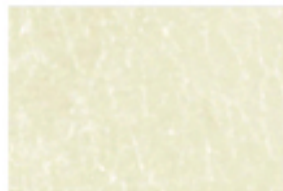
White 12 kt ◆ IT12.00WH AW=22g 50% GOLD