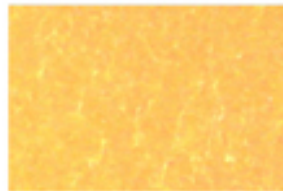
Red 23 kt IT23.00RG AW=18g 96% GOLD