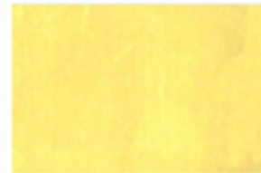
Glass 22 kt IT22.00GL AW=16g 92% GOLD