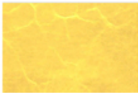
Surface 23 kt ◆ IT23.00SF AW=18g 98.5% GOLD