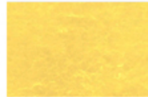
Glass 23 kt IT23.00GL AW=18g 96.5% GOLD