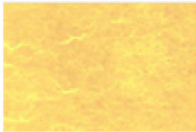
Fine Gold IT24.00FG AW=24g 100% GOLD

Best gold leaf average thickness is 0.36 to 0.5 microns.