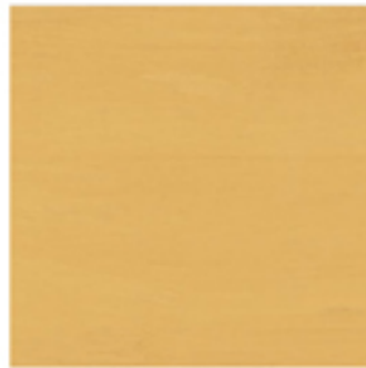
Ocher KBO/100, /500, /L, /5L