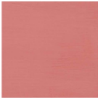
Traditional Red KBB/100, /500, /L, /5L