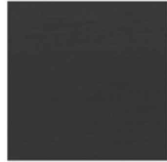
Black KBS100, /500, /L, /5L