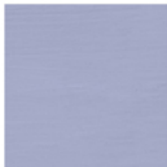
Blue KBE/100, /500, /L, /5L