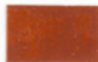
Micro Copper M9350M