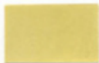
Majestic Gold M9222X