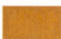
Micro Bronze M9250M