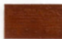
Nu-Antique Copper M9340AB