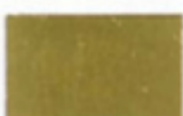
Sunset Gold M9233XB