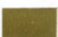
Nu-Antique Gold M9212GB