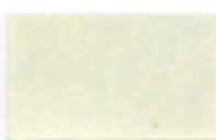
Hi-Lite Super Gold M9230Z