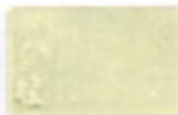
Micro Gold M9260M