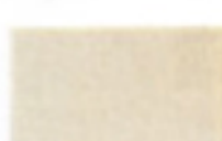
Super Sparkle M9110S